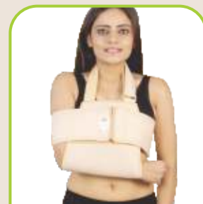
UNIVERSAL SHOULDER IMMOBILIZER