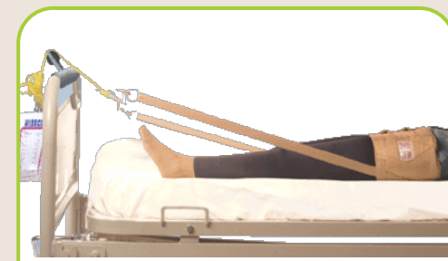
PELVIC TRACTION BELT