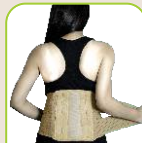
SACRO LUMBER BELT (CONTOURED)