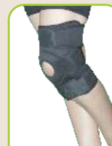
KNEE CAP PATELLA HOLE