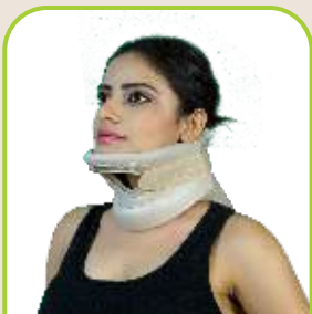
CERVICAL OTHOSIS (PHILADELPHIA)