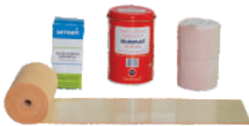
ELASTIC ADHESIVE BANDAGE