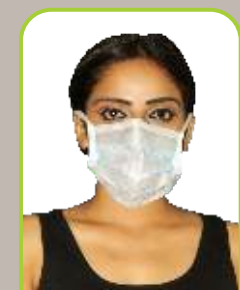
FACE MASK (TAI, ELASTIC, BULK)