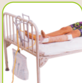
SKIN TRACTION KIT