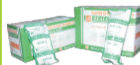
PLASTER OF PARIS BANDAGE B.P.