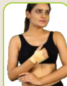
WRIST BRACE WITH THUMB