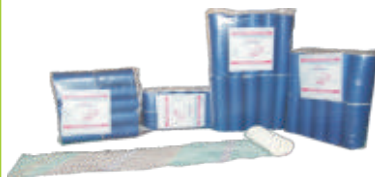
GAUZE ROLLED (BANDAGE)