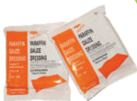
PARAFFIN GAUZE DRESSING (B.P.)