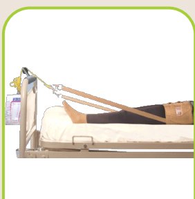
PELVIC TRACTION KIT