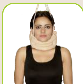
CERVICAL TRACTION KIT