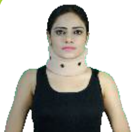
CERVICAL COLLAR SOFT WITH SUPPORT