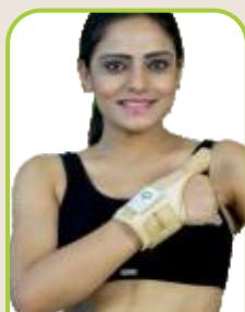
THUMB SPICA SPLINT