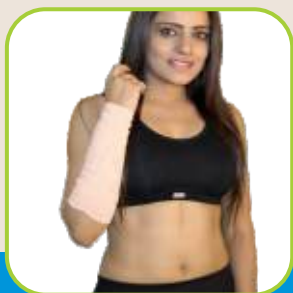
COTTON CREPE BANDAGE