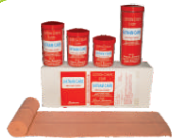
COTTON CRAPE BANDAGE