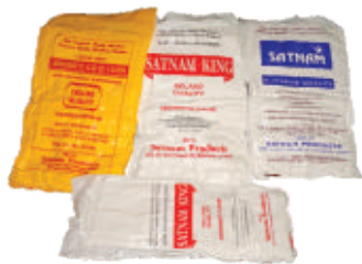
ABSORBENT GAUZE CLOTH