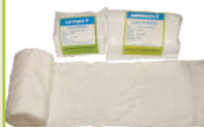
CAST PADDING (SOFT ROLL)