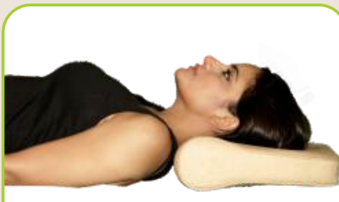
CERVICAL PILLOWS REGULAR