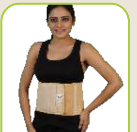
ABDOMINAL BELT (GOLD)