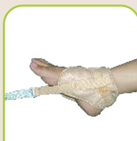
ANKLE TRACTION HOLDER