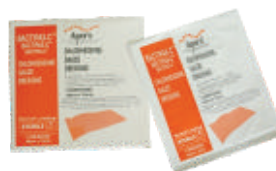
CHLORHEXIDINE GAUZE DRESSING (B.P.)