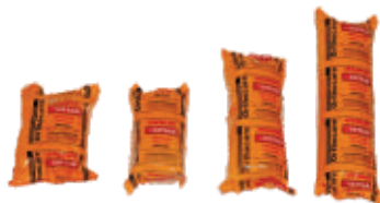
COTTON GRADE BANDAGE (ORTHOCARE)