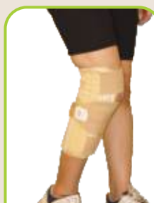
KNEE BRACE SHORT TYPE