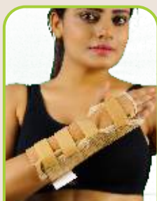
COCK-UP SPLINT UNIVERSAL