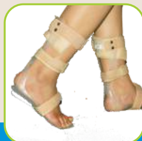
FOOT DROP SPLINT