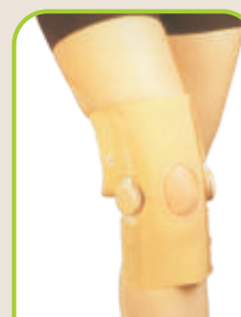
ELASTIC KNEE SUPPORT