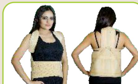
DORSO LUMBER SPINAL BRACE (TAYLOR BRACE)