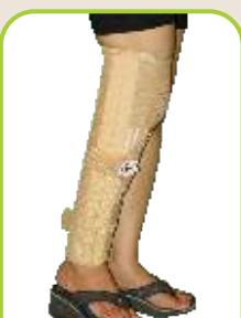
KNEE BRACE LONG TYPE