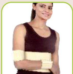
ELESITC SHOULDER IMMOBILIZER