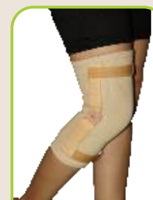
KNEE CAP WITH HINGES