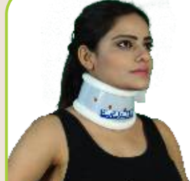
CERVICAL COLLAR WITH CHIN SUPPORT