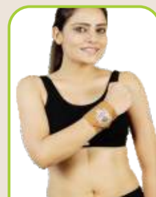
WRIST BINDER WITH D.LOCK