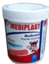
FIRST AID DRESSING (MEDI PLAST)