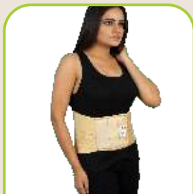
SACRO LUMBER BELT (GOLD)