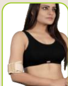
TENNIS ELBOW SUPPORT WITH PRESSURE PAD