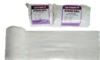
GAMJEE ROLL (UNSTERILISED)