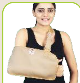
ARM SLING POUCH ADJUSTABLE