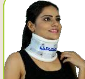
CERVICAL COLLAR ADJUSTABLE HEIGHT