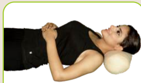
CERVICAL PILLOWS ROUND SOFT