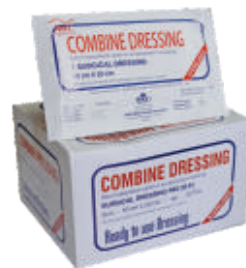
COMBINE DRESSING PAD