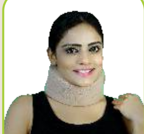
CERVICAL COLLAR SOFT