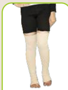
VARICOSE VEIN STOCKING (ABOVE KNEE)