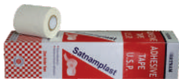
ADHESIVE TAPE (HOSPITAL PACK)