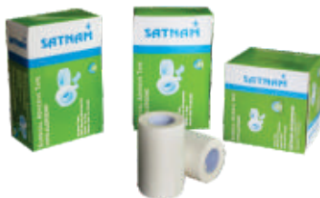
SURGICAL PAPER TAPE