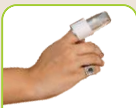
FINGER COAT WITH VELCRO