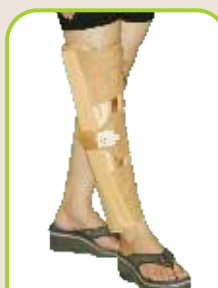
KNEE BRACE LONG TYPE (PREMIUM)