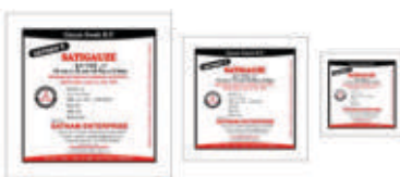
GAUZE SWAB (B.P.) (GAMAA STERILE)