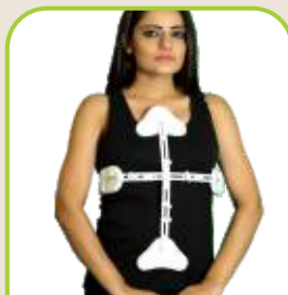
ASH BRACE (HYPER EXTENSION BRACE)