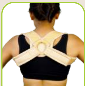
MEEK CLAVICLE BRACE (BACK)