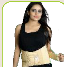
SACRO LUMBER BELT (PREMIUM)