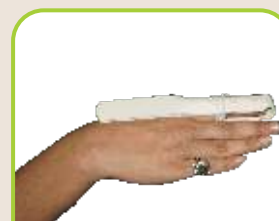
FINGER EXT. SPLINT