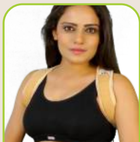
MEEK CLAVICLE BRACE